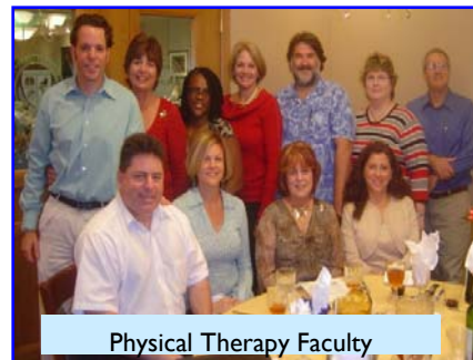
Physical Therapy Faculty