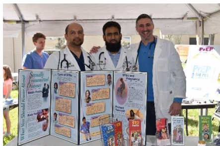
-Spring 2019, Hendry County Health Fair

ANEW Trainees were heavily involved in Hendry and Glades County community events, such as the annual Hendry County Health Fair where they engaged with community members and worked with the Florida Department of Health performing HIV screenings and promoting safe sex practices.