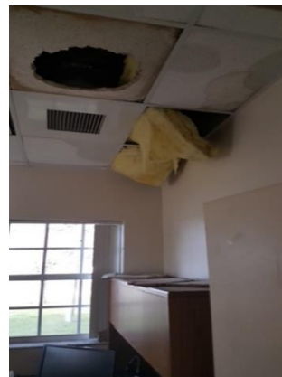
Before (Post Hurricane)