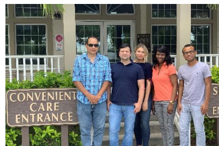
-Summer 2019, ANEW Traineeship Clinical Orientation

ANEW Trainees worked alongside, clinical preceptors, staff, and community health directors to address, treat, and prevent chronic health disparities and concerns such as hypertension, diabetes, obesity, safe sex practices, pregnancy, infant care, and flu vaccine completion.