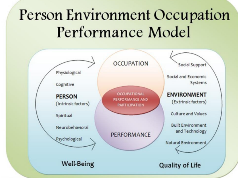
Baum, C.M., & Christiansen, C.H. (2005). Person-Environment-Occupation-Performance: An occupation -based framework for practice

The curriculum sequence is developmental. Our educational philosophy and design is based on Bloom's Taxonomy. The taxonomy is a guide to help facilitate the teaching and learning process as the student progresses from novice to entry-level practitioner and constructs knowledge at increasing levels of depth and breadth. The curricular content is organized around the Person-Environment- Occupation-Performance Model (PEOP) (Christiansen & Baum, 2005) and our curricular themes which reflects the faculty's beliefs about occupation based client-centered practice. The curriculum scope and sequence is designed to first expose the students to "typical" occupational development and performance. Based on an understanding of typical development