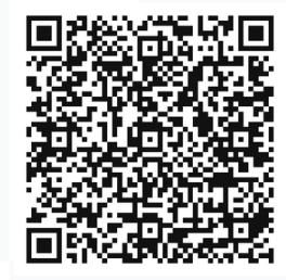
Scan for more information.